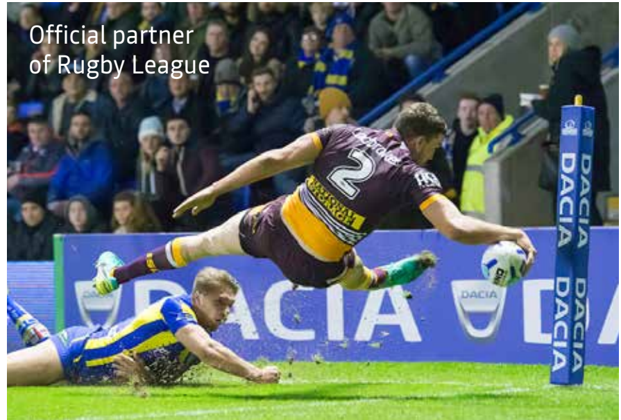
Official partner of Rugby League

For us, putting in the extra mile doesn't stop at making great value cars. We take great pride in playing an active part in the community and giving back to communities throughout the UK. We support the life-saving work of the Nationwide Association of Blood Bikes . We get stuck in as the official partner of Rugby League . We also run an annual Dacia Day , full of fun and games for our amazing Dacia drivers – maybe we'll see you there next year? In the meantime, keep up with us on our Facebook page or Youtube Channel.