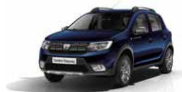
Cosmos Blue (RPR)