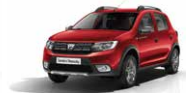
Cinder Red (B76)