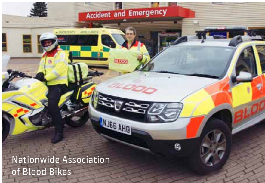
Nationwide Association of Blood Bikes