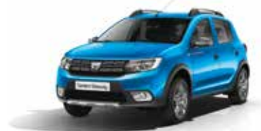
Azurite Blue (RPL)