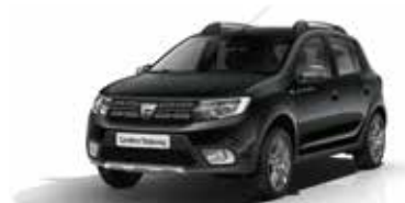
Slate Grey (KNA)