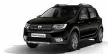
Pearl Black (676)