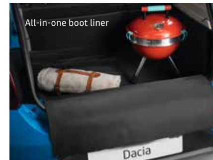
All-in-one boot liner