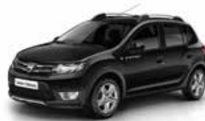
Pearl Black (676)