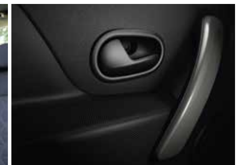
Graphite front door handles - Lauréate only