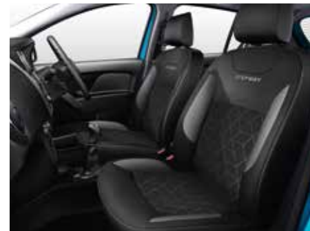
Dark carbon 'Stepway' cloth upholstery