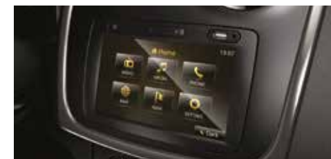
MediaNav 7" touchscreen multimedia system - standard on Lauréate only