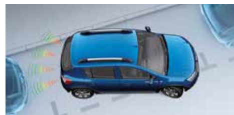
Rear parking sensors - standard on Lauréate only