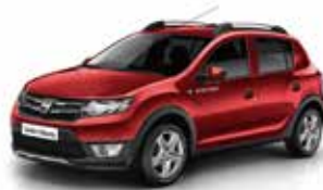
Cinder Red (B76)