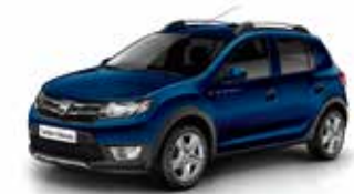
Cosmos Blue (RPR)