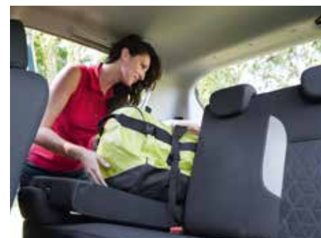
60/40 split folding rear seats