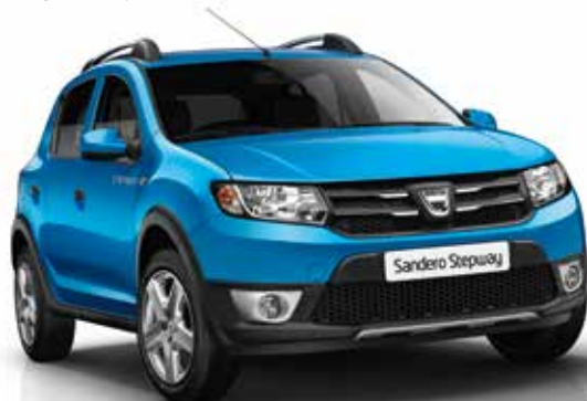
Model shown is a Sandero Stepway Lauréate in Azurite Blue