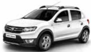
Glacier White (369)