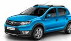
Azurite Blue (RPL)