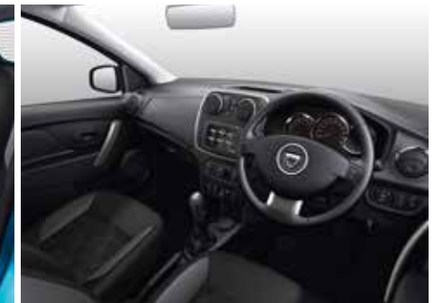
Lauréate interior with MediaNav