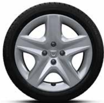
16" 'Stepway' design wheels