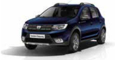
Cosmos Blue (RPR)