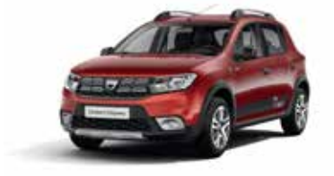
Fusion Red (NPI)