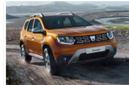
All-New Duster Awards: