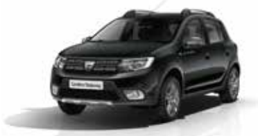
Slate Grey (KNA)