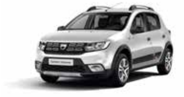
Highland Grey (KQA)