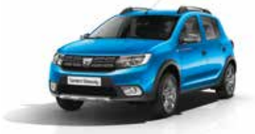
Azurite Blue (RPL)