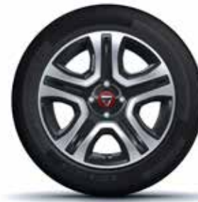
16" 'Flex Stepway Style' alloy-look wheels