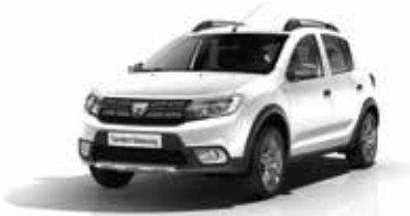
Glacier White (369)