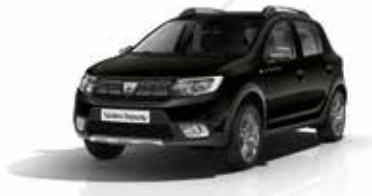
Pearl Black (676)