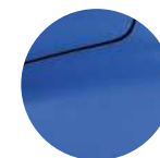
IRON BLUE (1)(3)

(1) Metallic colours - (2) Opaque colours (3) not available on the Extreme SE