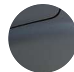
PEARL BLACK (1)