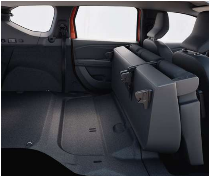
CAN BE CONFIGURED AS A 2, 3, 4, 5, 6 OR 7-SEATER

For long items, there's up to 1,807 litres of cargo space with the bench seat folded down. Make your journey more enjoyable and find your route with the multimedia system: 8-inch touch screen with Navigation, smartphone replication via wifi*, Bluetooth connection everything is there. A true Swiss Army knife style! *depending on the version