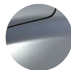
SLATE GREY (1)