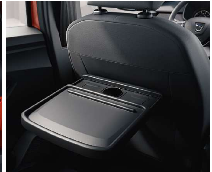
SLIDING TRAY TABLES AT THE REAR

*minimum boot volume of 160 L and a maximum of 1,807 L, depending on the version and configuration of the passenger compartment.