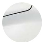
GLACIER WHITE (2)