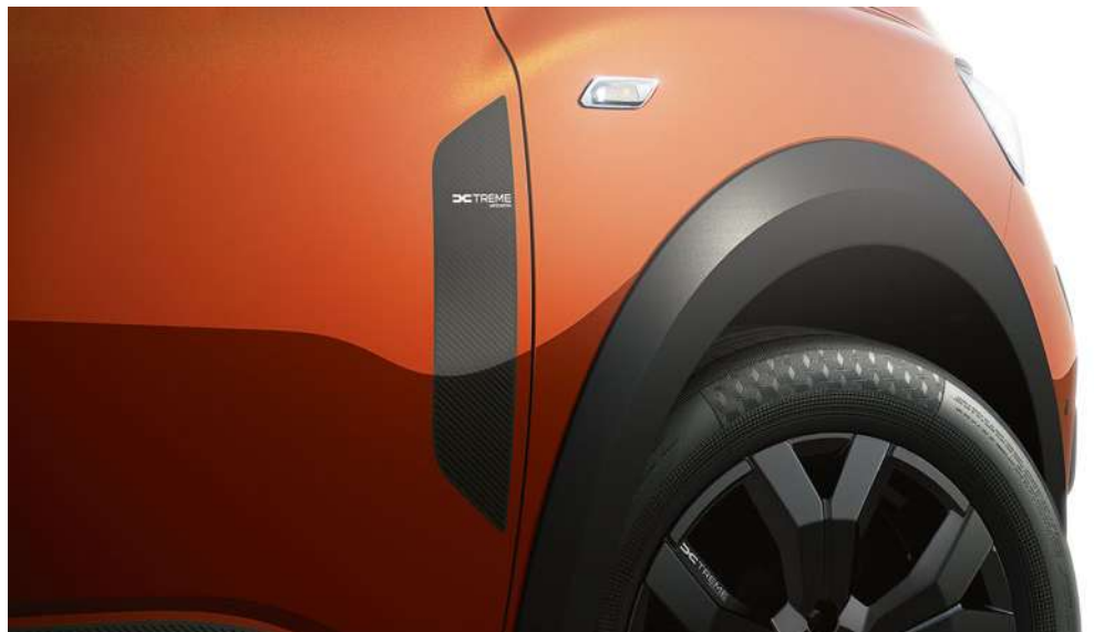
FLUSH WHEELS AND PRONOUNCED ARCHES