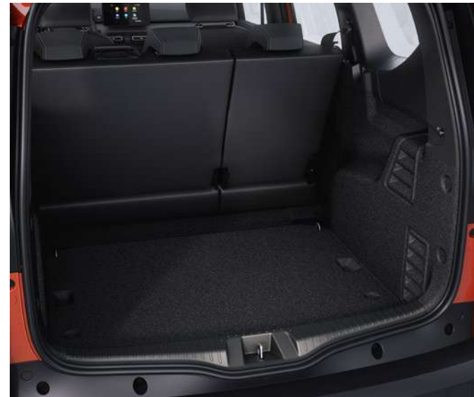
FROM 160 TO 1,807 LITRES OF BOOT VOLUME

*minimum boot volume of 160 L and a maximum of 1,807 L, depending on the version and configuration of the passenger compartment.