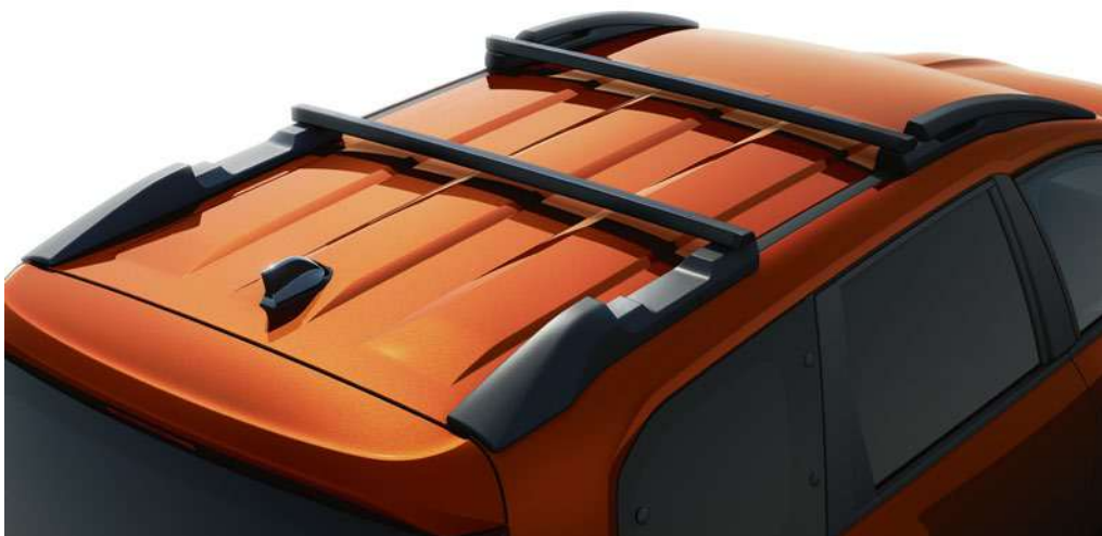
MODULAR ROOF BARS WITH A FEW TURNS OF THE KEY

access to the boot. Go all out with the Extreme Limited Edition: black-clad wheel arches, alloy wheels, door mirrors and shark-fin aerial. Distinctive stickers and protective Megalith Grey skid plates. All-New Dacia Jogger, designed for you and your family.