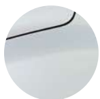
MOONSTONE GREY (1)